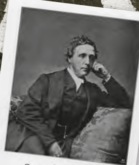
Real name: Charles Lutwidge Dodgson