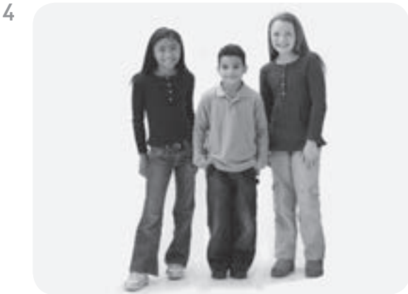
The boy is the short .