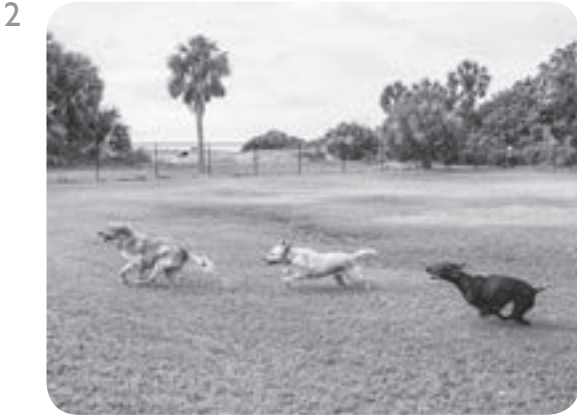
The black dog runs the slow .