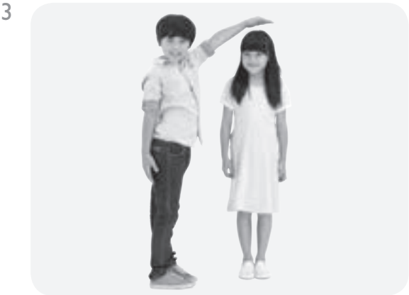
The girl is short than the boy.