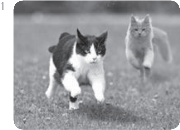
This cat runs fast e r than that cat.